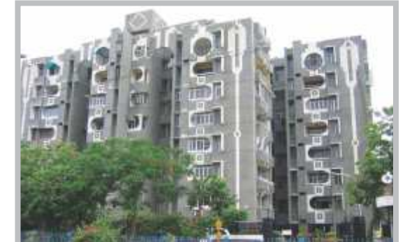
River View Apartment, Mayur Vihar, New Delhi