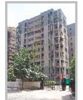
Anuradha Apartment, Vaishali