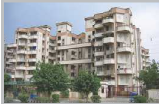
New Ardesh Society, Dwarka, New Delhi