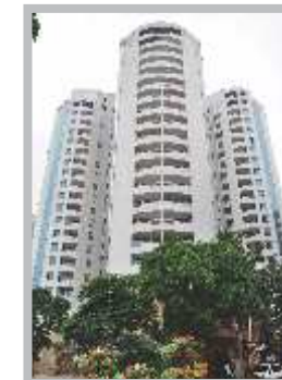
Acacia Valley, Vaishali