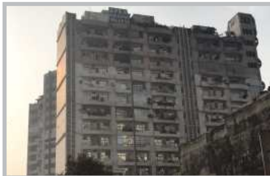
Apex Green Valley, Sector-9, Vaishali