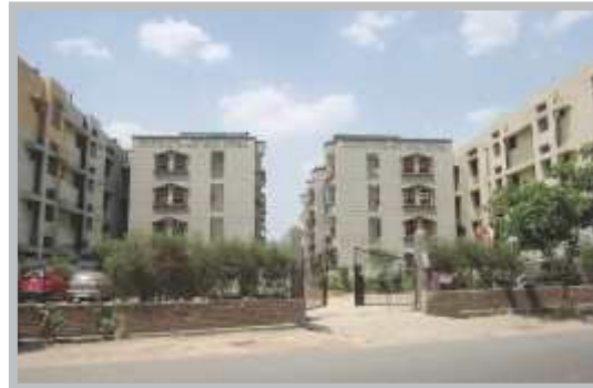
Vardaan Apartment, Indirapuram