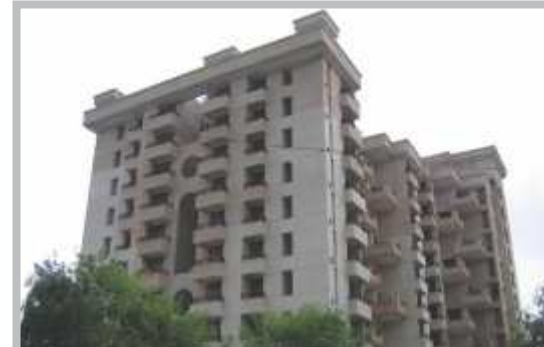
Khatler Group Housing Society, Dwarka, New Delhi