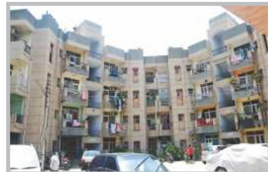
Media Times Apartment, Indirapuram