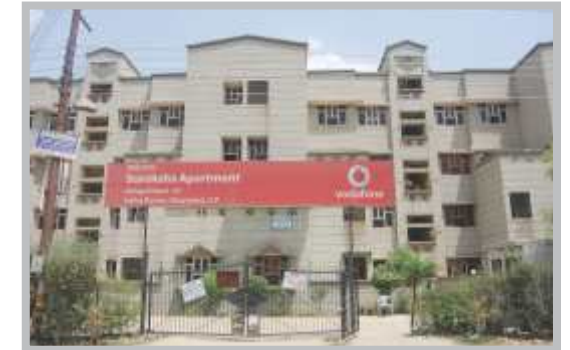
Suraksha Apartment, Indirapuram