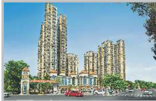
Apex Athena, Sector-75, Noida