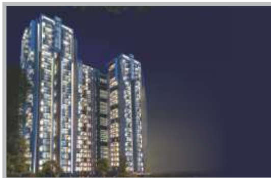
Apex The Florus, Sector-18, Vasundhara