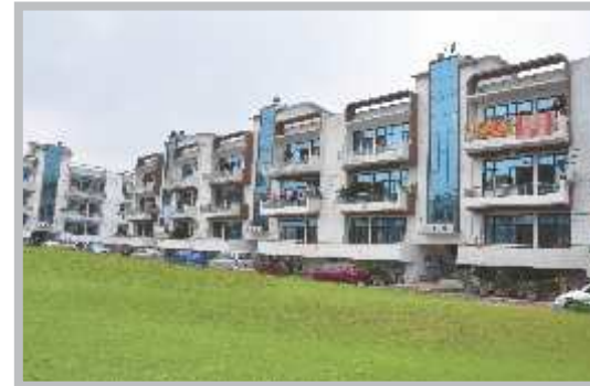
Royal Castle - 1, Indirapuram